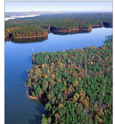
B. Everett Jordan Lake

Inside this edition please refer to the chart entitled Water Quality Data Table of Detected Contaminants for a detailed analysis of our drinking water.